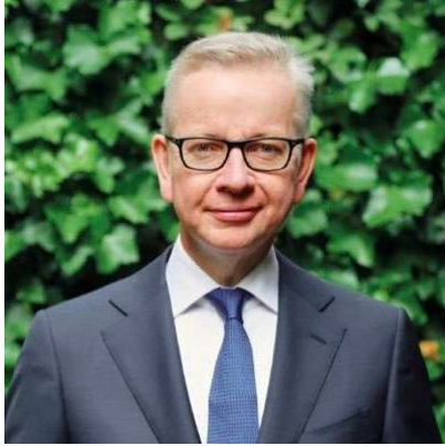
Michael Gove (Cabinet Minister)