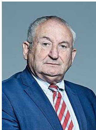
John Bird (Big Issue Founder)