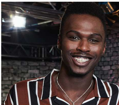
Mo Jamil (Winner of The Voice)