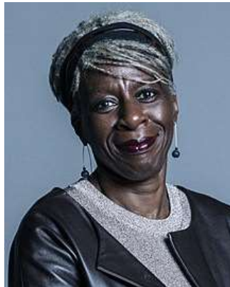
Lola Young (Baroness in House of Lords)